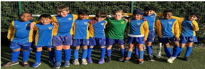
Our U9 and U11 yellow teams have been playing hard this week and we were delighted to host both games at home – go yellows!

This term : 1 st Garnet (2020) 2 nd Southwell (2050) 3 rd Owen (1750) 4 th : Campion (1600)