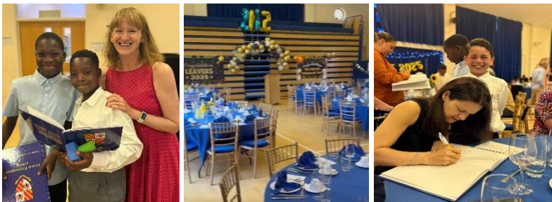
Leavers Dinner 2025