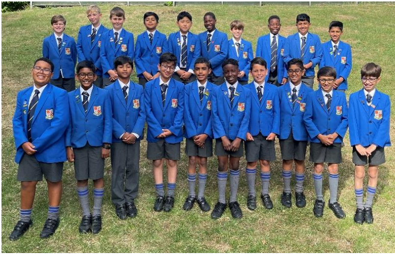
Good luck to our Rudiments class of 2025, we will miss you!